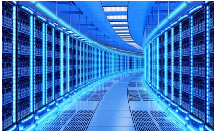
Traditional air cooling methods are inefficient and expensive to dissipate the large amount of heat generated in data centers.

Increased server rack density has been greatly impacted by advancements in artificial intelligence, Internet of Things (IoT), machine learning, blockchain, cryptocurrency and the demand for increased computing power and performance requirements. This has contributed to an increase in the amount of heat generated in data centers. Traditional methods of air cooling have fallen short of meeting the thermal management requirements for the latest generation of servers, central processing units (CPUs) and graphics processing units (GPUs).