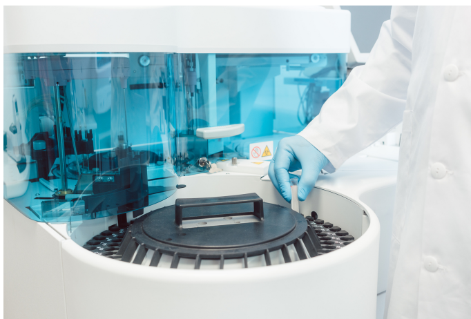
A centrifuge tub must maintain a precise temperature between 0°C and 40°C throughout the centrifuge process.

Centrifuge heat load cooling requirements can range from less than 30 to more than 150 Watts depending on the centrifuge type and size. Cooling solutions must be able to efficiently remove the required heat load with a high coefficient of performance to minimize power consumption.