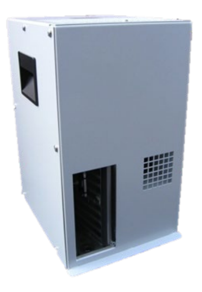
Laird Thermal Systems designs and manufactures compressor-based refrigeration systems for reagent cooling applications.

Since there are many unique attributes that need to be ascertained from a reagent storage chamber, a custom cooling system configuration may be required to optimize performance and long-life operation. Laird Thermal Systems offers strong engineering design services with a global presence that supports onsite concept generation, thermal modeling, mechanical and electrical design and rapid prototyping. The company also offers validation test services to meet unique compliance standards for each medical industry.