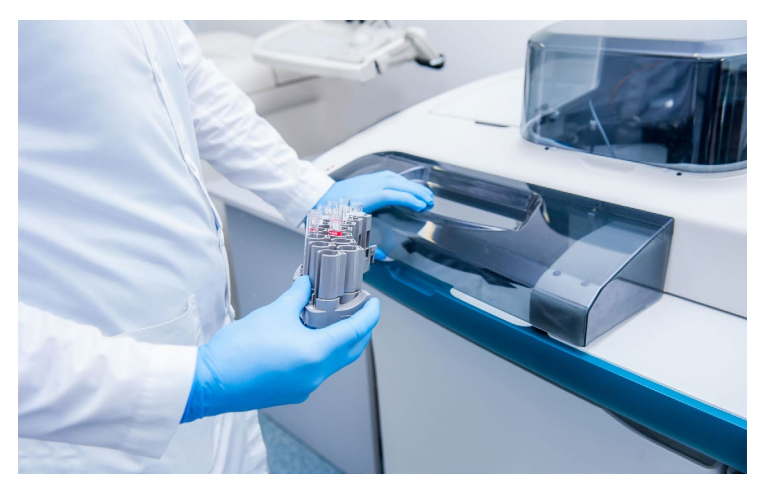
Temperature control is vital to preserve medical reagents.

Given the high cost of many reagents, thermal control of reagent storage systems should be taken into consideration. Compressor-based refrigeration and freezer systems offer a high coefficient of performance (COP) to efficiently deliver precise temperature control below ambient. Technology advancements have eliminated many previous disadvantages of compressor-based systems including size, weight, reliability, eco-friendliness, and cost. Standard and custom compressor-based refrigeration systems are an ideal solution for thermal control of biological materials like reagents.